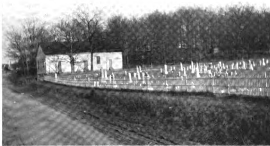
OLD BRIDGEWATER CHURCH AND CEMETERY