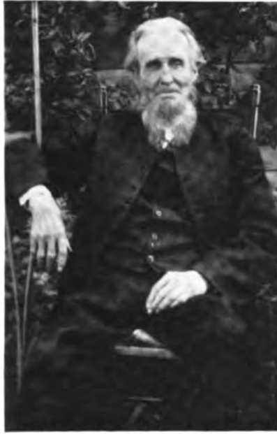
JOHN A. KINZIE